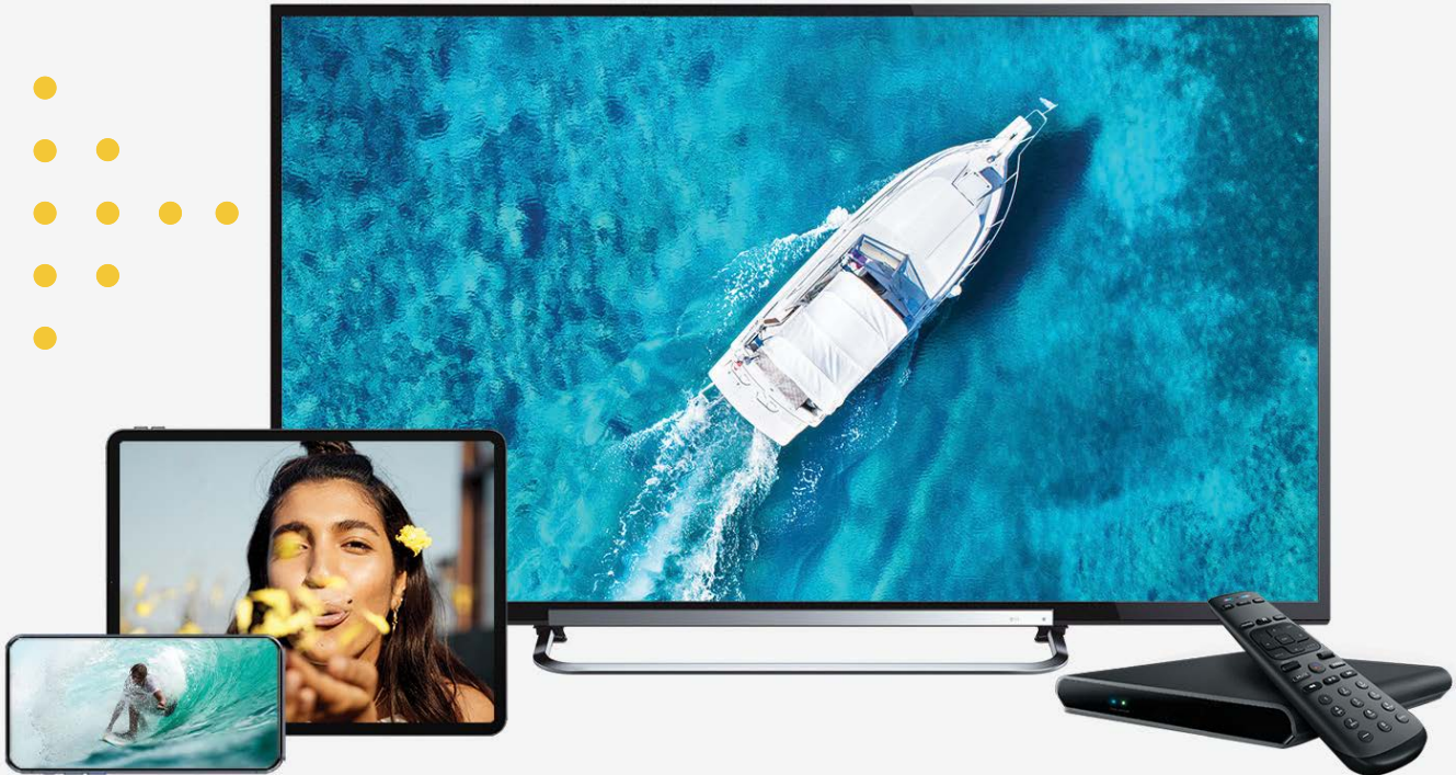
Exclusive DIRECTV STREAM Device (sold separately).